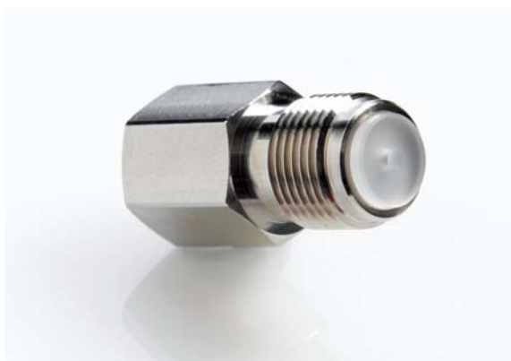
Model – LC-10ATvp, LC-10AT Inlet Check Valve