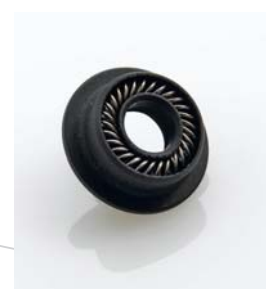
Model - 114M, 116, 118, 125, 126, 127, 128