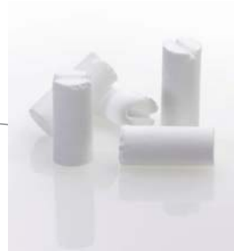
Model – 1050, 1100