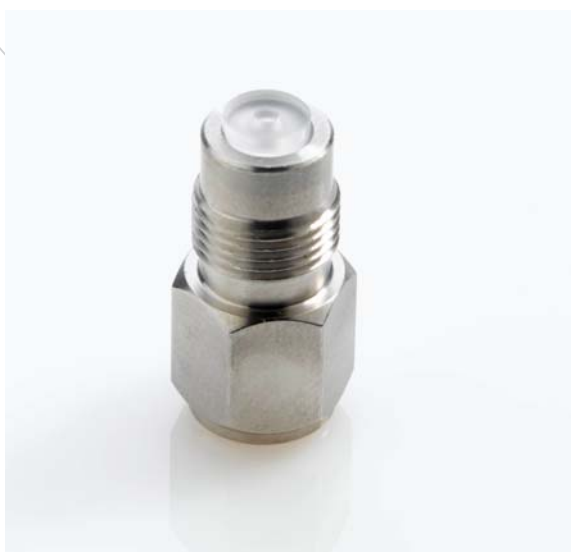
Model – LC-10ATvp, LC-10ADvp Outlet Check Valve