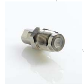
Model – L-7100 Inlet Check, Valve Assembly