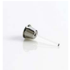
Model – 1090