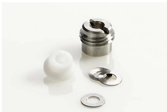
510 Kit Insert Seal Parts Kit