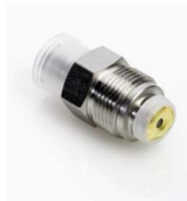
Model – 1100