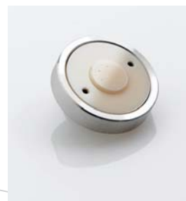
Model – SIL-10A, SIL-10AXL, SIL-10AI