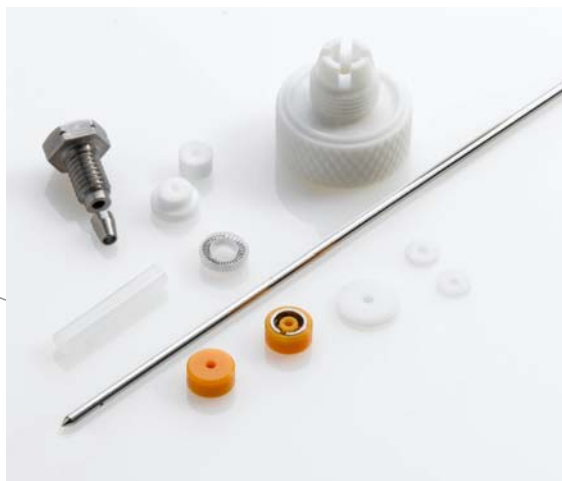
2690, 2695 Kit