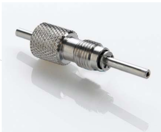
Model – 510, 515, 600, 610 Draw-Off Tube Assembly