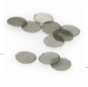
Model – 1100