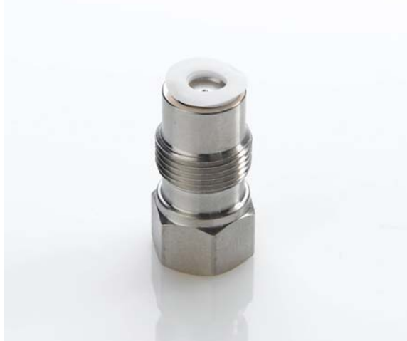
Model – 510 Outlet Check Valve Assembly – Actuator Style