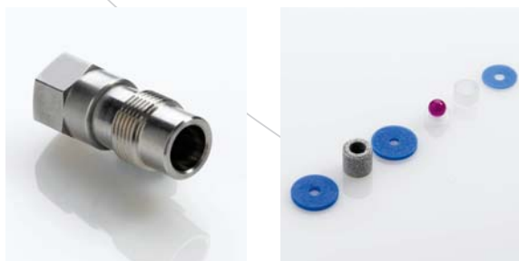
Model – 1525EF, 510, 515, 600, 610 Outlet Check Valve Housing – Ball & Seat