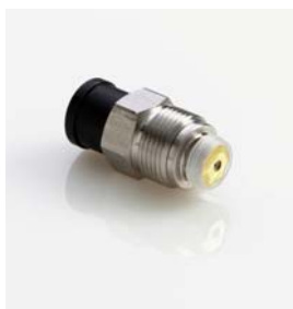
Model – 1050, 1100