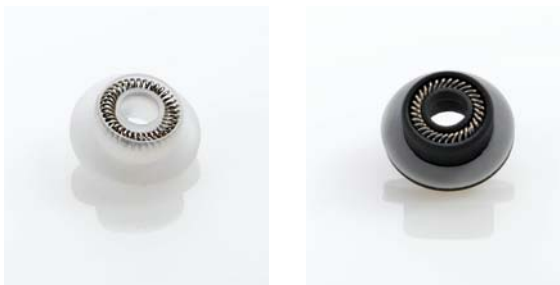
Model – 1515, 1525, 510, 515, 600, 610 Super Seal – Analytical heads