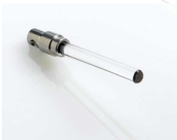
Model - 110A, 110B, 112 Sapphire Plunger