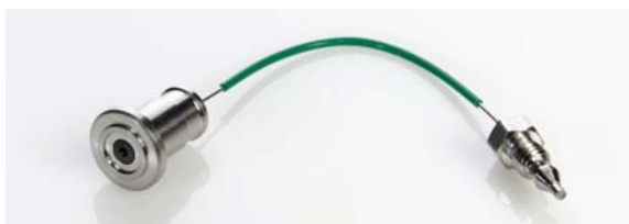
Model – 1100 Needle Seat Assembly