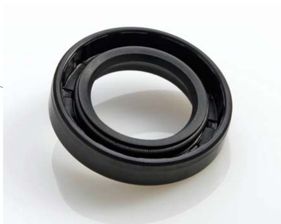
Model – M6KA, 510, 590, 600 Oil Seal