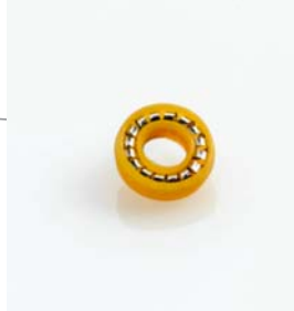
Model – Constametric I, II, III, 3000, 3200, 3500, 4000, 4100 Sapphire Plunger