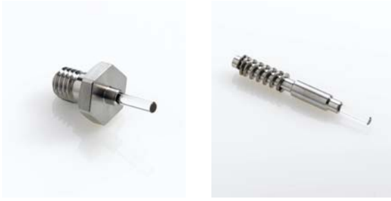
Model – LC-600, LC-9A, LC-10AD Sapphire Plunger