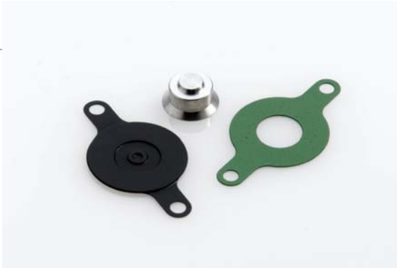
Model – 1515, 1525, 510, 515, 600, 610 Reference Valve Rebuild Kit