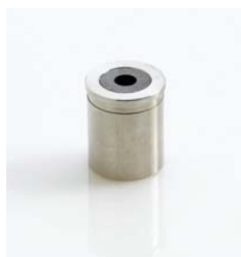
Model - 110A, 110B Guide Sleeve, Graphite Plunger Guide