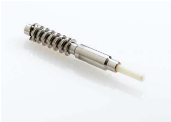
Model – LC-10ADvp, LC-20AD Ceramic Plunger Assembly