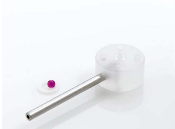
Inlet Tube Assembly w/Ball &amp; Seat