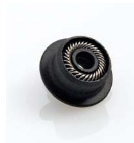
Model – SIL-10AXL, SIL-10ADvp