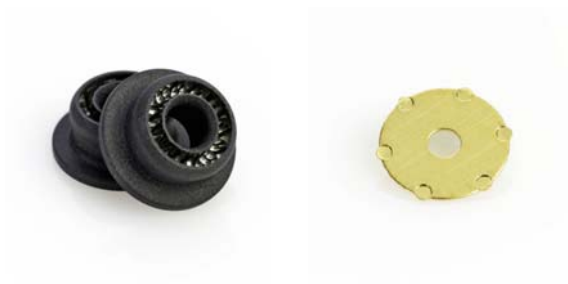
Model – 1050, 1100