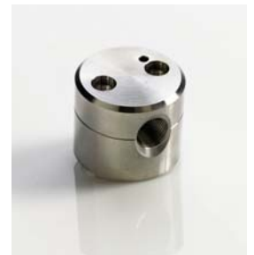
Model – 510, 590, 600 Round Pump Head w/Ball & Seat Outlet Check Valve