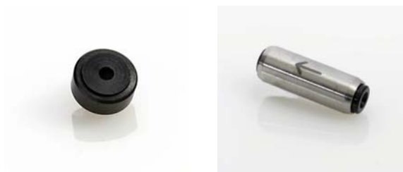
Model – 1090 Replacement Sieve