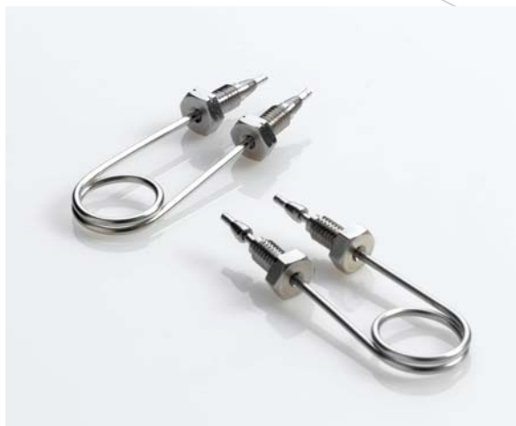
Model – 510, 515, 600, 610 Tube, Left Outlet Pigtail