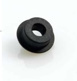
Model – 655, 6000, 6200, 6200A, L-7100 Ceramic Plunger