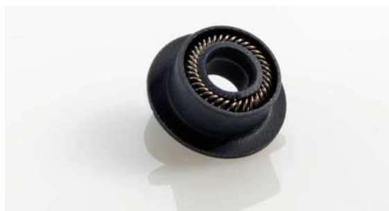
Model - 114M, 116, 118, 125, 126, 127, 128