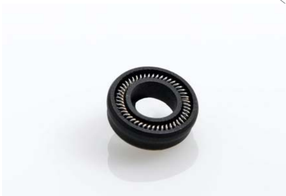
Model – 510, 515, 590, 610, 600E Plunger Seal, Black, EF Heads