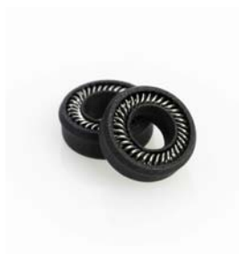
Model – 1050, 1100