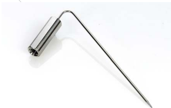
Model – 1100 Needle Assembly