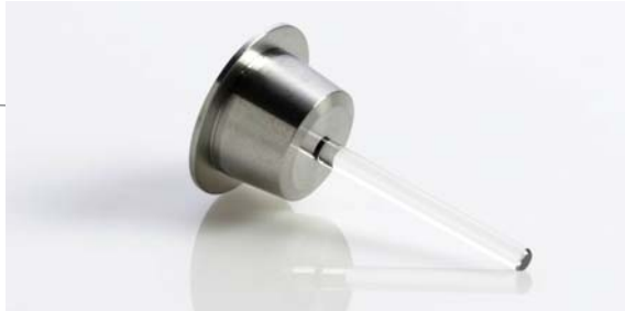
Model – 1050, 1100