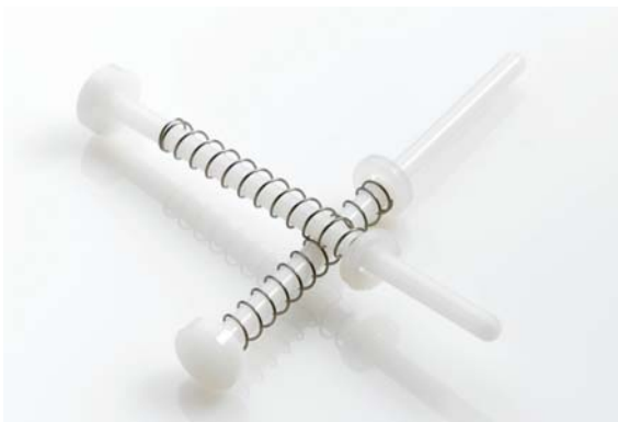
Model – 1515, 1525, 510, 515, 600, 610 Indicator Rod Kit