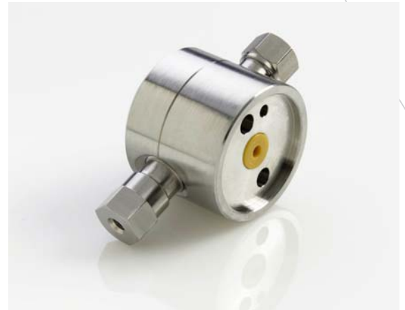
Model – M45, 501, 510, 590 Round Pump Head w/Actuator Outlet Check Valve