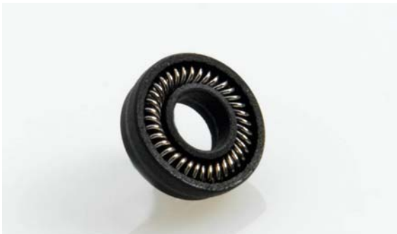
Model – Constametric I, II, III, 3000, 3200, 3500, 4000, 4100 Plunger Seal, Black