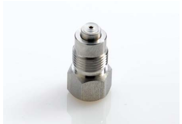
Model – LC-600, LC-9A, LC-10AD Inlet Check Valve