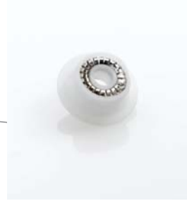
Model – LC-10AS Plunger Rinse Seal