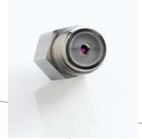
Model – LC-6A, LC-10AS Inlet Check Valve