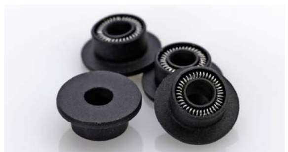
Model – 1090