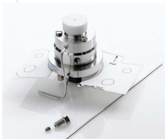
2690, 2695 Kit Seal Pack Kit, Assembled