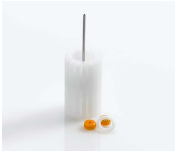
715, 717 2690, 2695 Kit HPMV 1 & 2 Rebuild Kit w/Spool